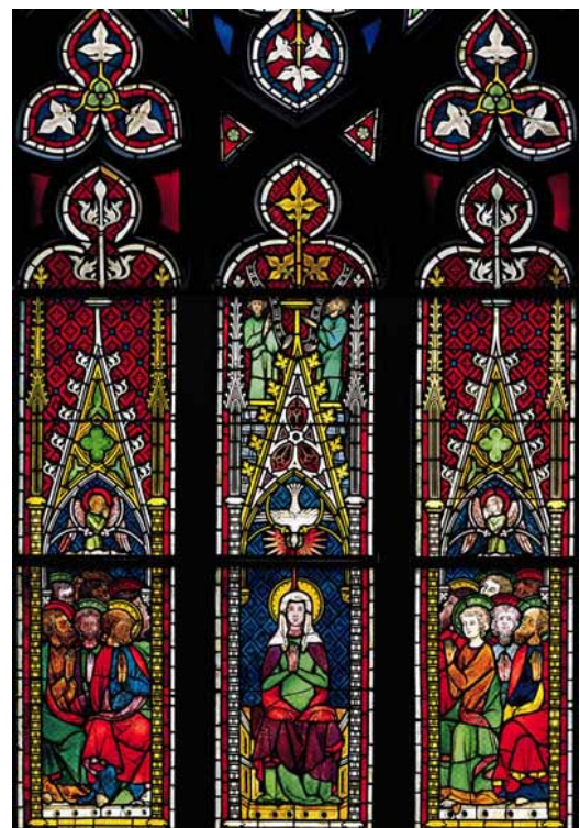
(Window from the Konigsfelden Abbey, Switzerland)

The Pentecost event was the fulfillment of a promise which Jesus gave concerning the return of the Holy Spirit. The speaking in tongues, which was a major effect of having received the Spirit, is interpreted by some to symbolize the church's worldwide preaching. Christians consider the Day of Pentecost to be the birthday of the church because, from that moment on, the disciples carried the message of Christ everywhere they went all over the world. The liturgical color for the feast is red. The Day of Pentecost is identified by the Book of Common Prayer as one of the feasts that is "especially appropriate" for baptism. (p. 312).